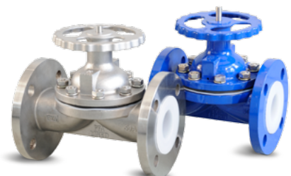
PFA DIAPHRAGM VALVE